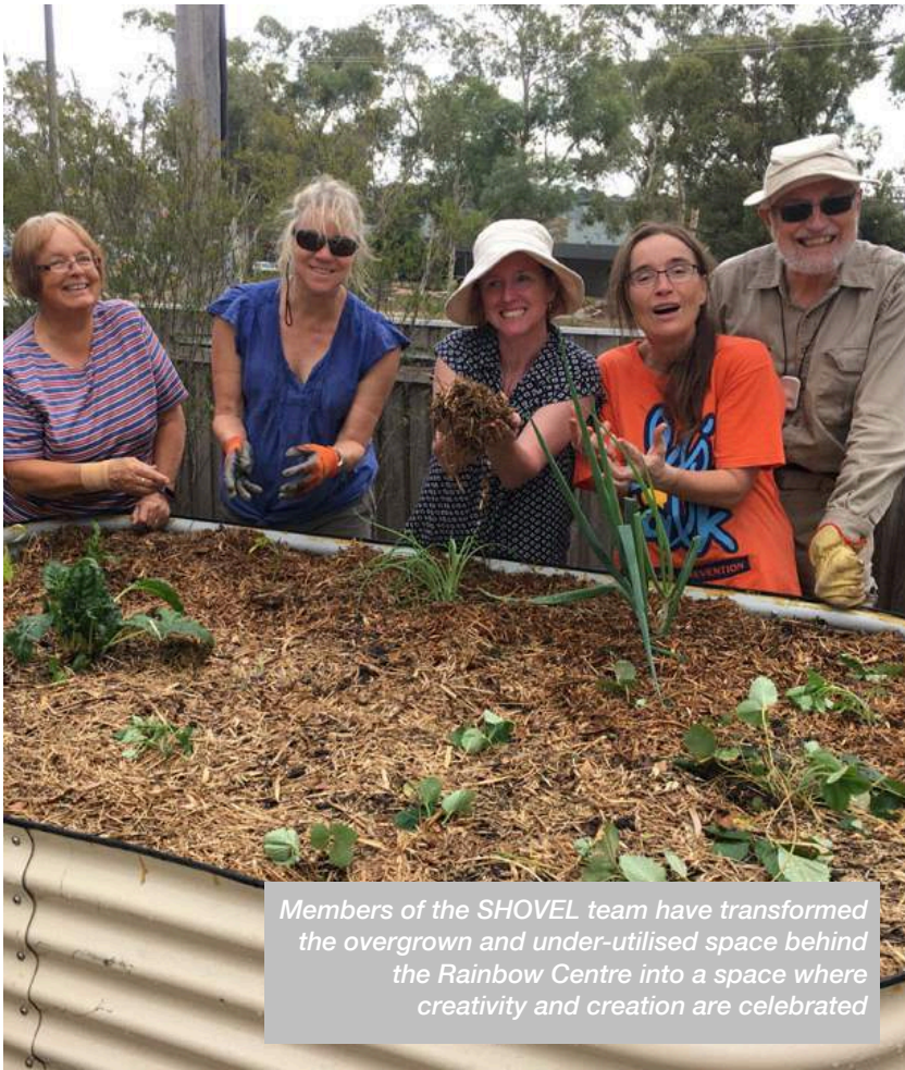
Members of the SHOVEL team have transformed the overgrown and under-utilised space behind the Rainbow Centre into a space where creativity and creation are celebrated