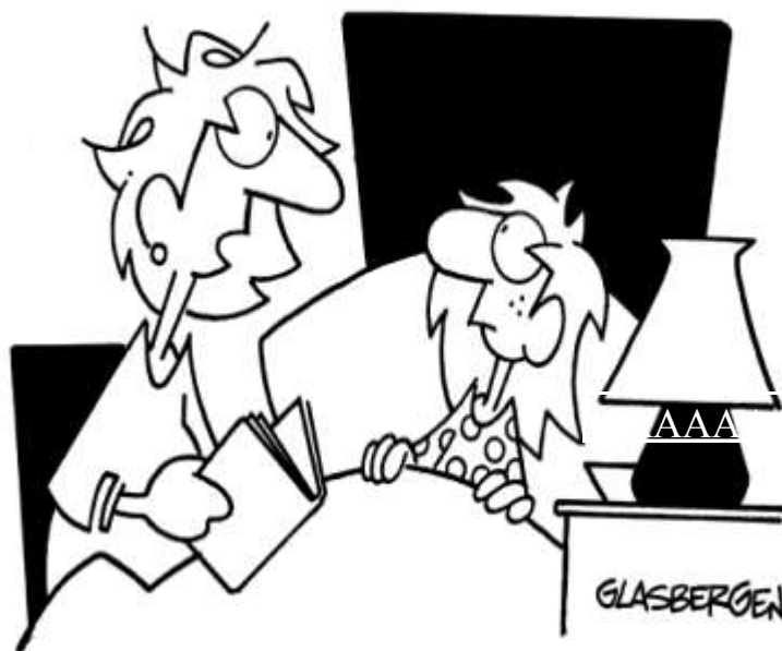
"Yes, the disciples followed Jesus... but not on Twitter."