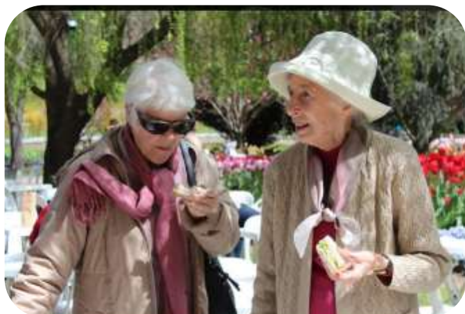
Volunteers are always appreciated. More drivers are always needed!