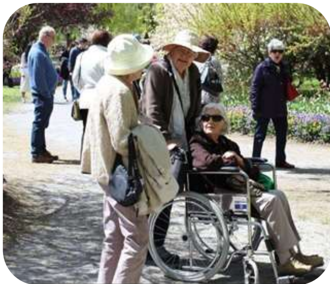
Fun was had by all!!