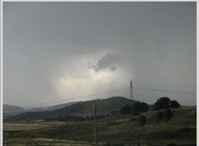
A fist full of clouds

https://comewalkwithme-reflections.blogspot.com