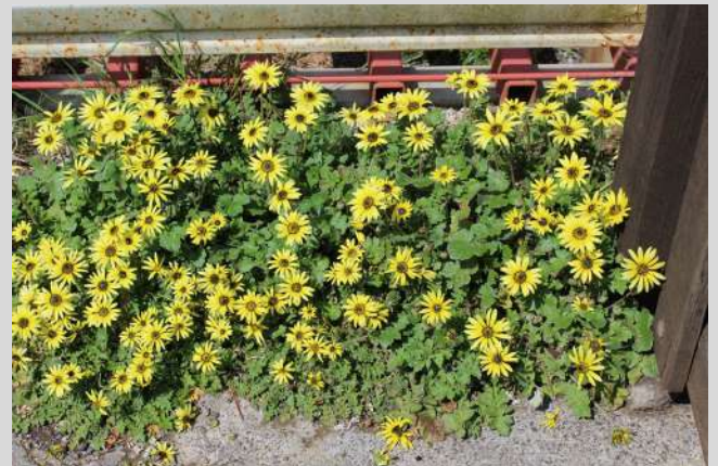
A verge of bright, smiling daisies.

https://comewalkwithme-reflections.blogspot.com