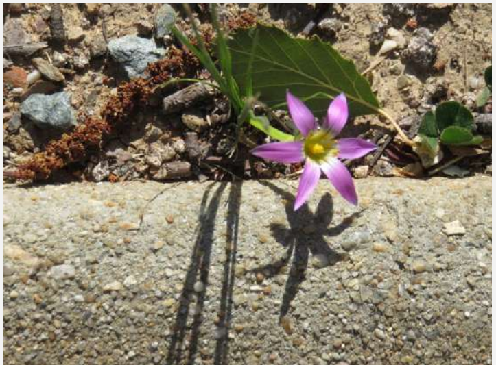
Ambushed by love.

https://comewalkwithme-reflections.blogspot.com