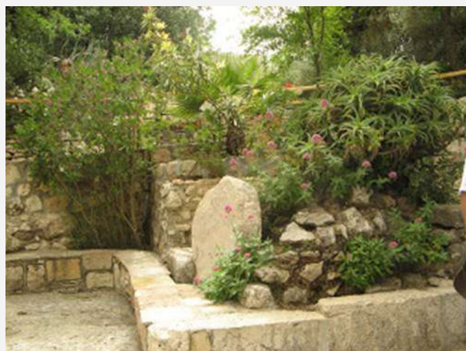
The Tomb Garden Jerusalem