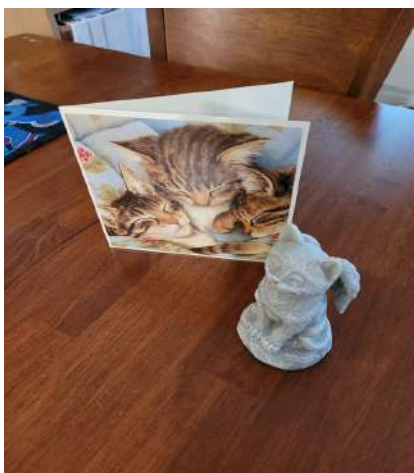
Rest in peace April