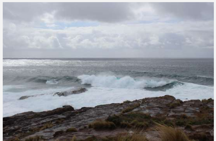
As wide and vast as the Lord's glory

https://comewalkwithme-reflections.blogspot.com