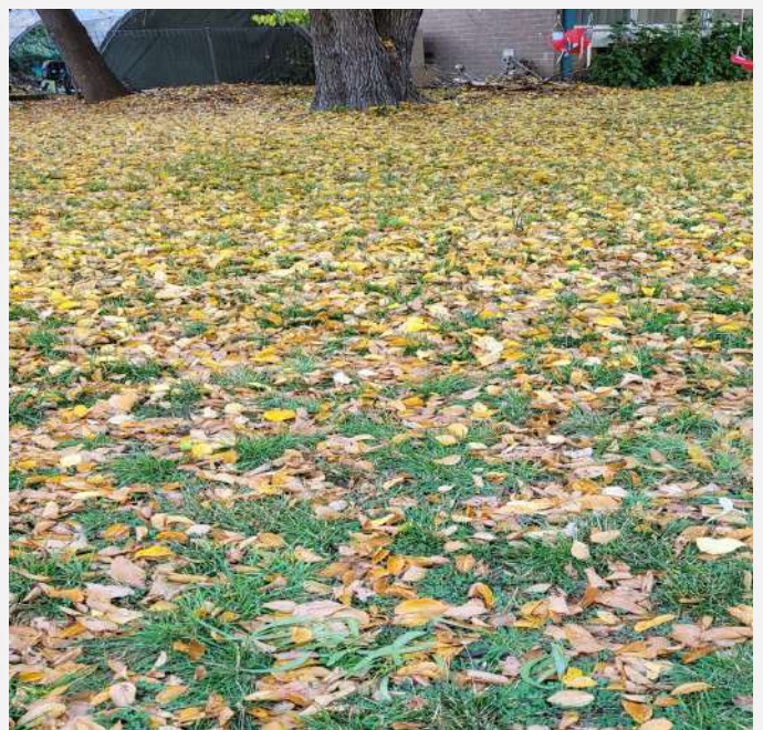
A carpet of leaves

https://comewalkwithme-reflections.blogspot.com