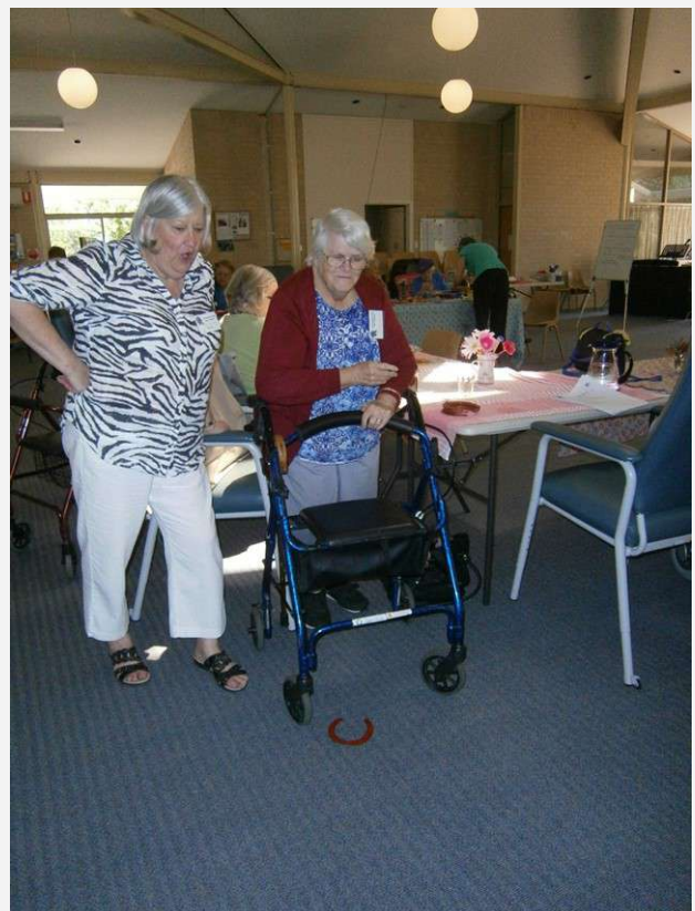
Let me help you – volunteering at Covenant Care

https://comewalkwithme-reflections.blogspot.com