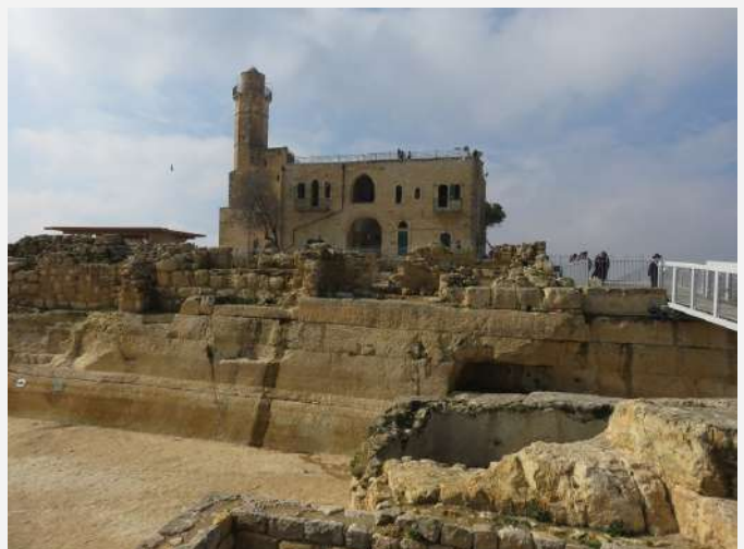
The Prophet Samuel's Tomb and National Park Israel

https://comewalkwithme-reflections.blogspot.com