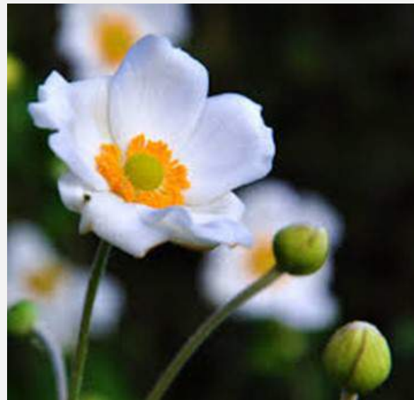
The joy of the dancing windflowers

https://comewalkwithme-reflections.blogspot.com