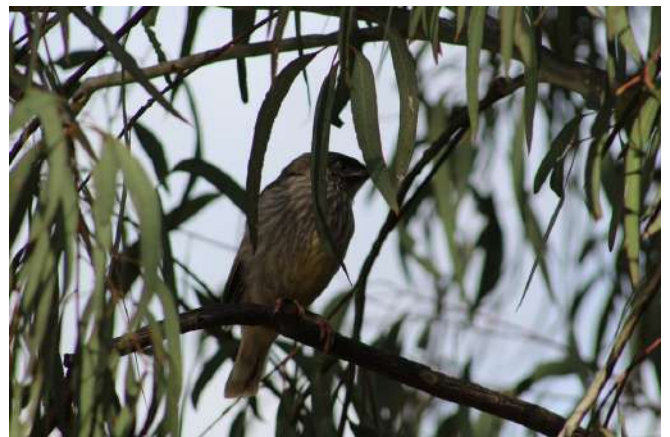
And the little bird sang

https://comewalkwithme-reflections.blogspot.com