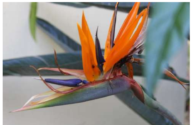
A thing of beauty

https://comewalkwithme-reflections.blogspot.com