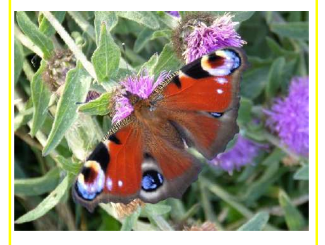
A delicate, fragile creature.