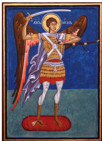
Archangel Michael with sword

Daily 10.30am-3.30pm (Closed Saturday 12 March)