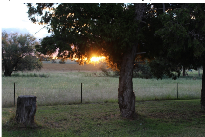
God in the morning.

https://comewalkwithme-reflections.blogspot.com