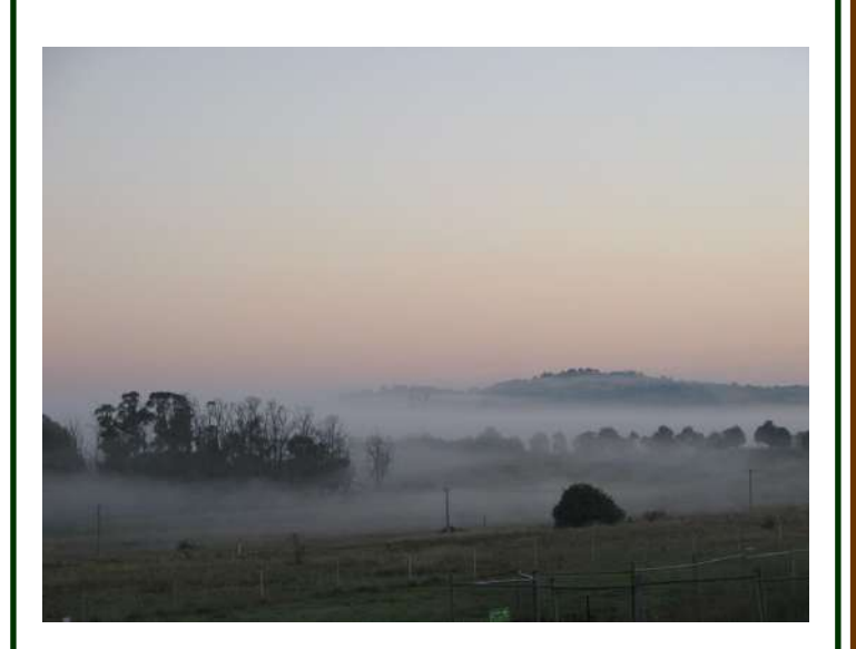
And a new day dawns

https://comewalkwithme-reflections.blogspot.com