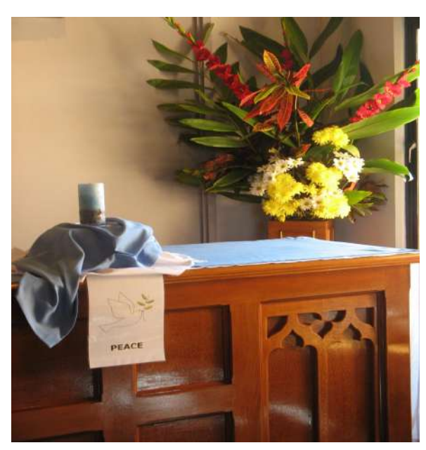
Let us pray

https://comewalkwithme-reflections.blogspot.com