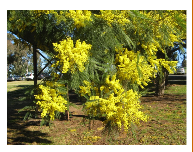
Whispering in the wattle tree

https://comewalkwithme-reflections.blogspot.com