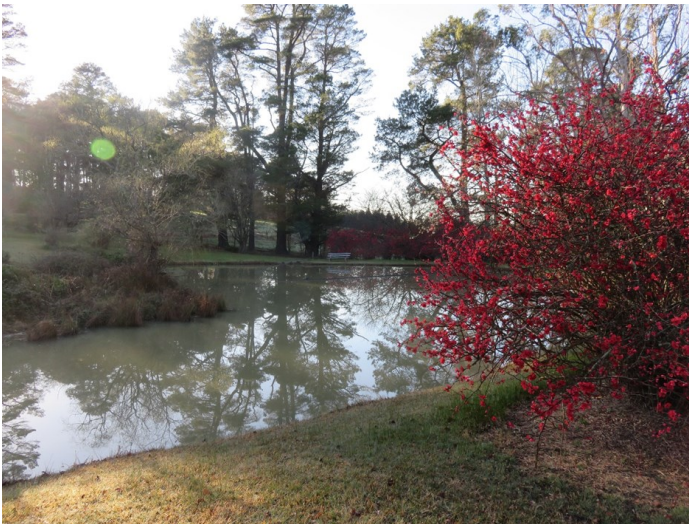
By still waters