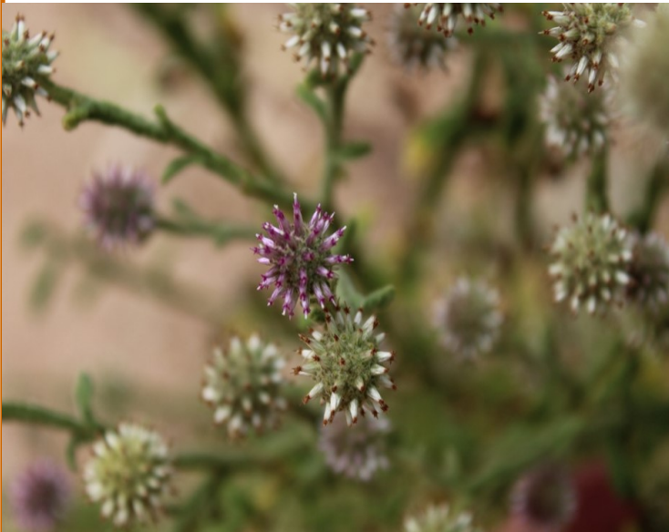
Made by God

The gardens are full of wonder and mystery. There is colour and shape among the great variety of flowers, there is perfume, there are bees, there are butterflies, there are thousands of raindrops, tiny baubles bursting with life giving water and the bird bath is full much to the delight of the Rosellas, the Finches and the very busy Willy Wagtail. Birdsongs echo from the tree top and in their pauses, there is silence and I am filled with wonder at the mystery. It all reminds me of Louis Armstrong's song: What a Wonderful World. 'When we are filled with wonder it is as if we have encountered the world in all its beauty and mystery for the very first time.' (Sharon Blackie.)