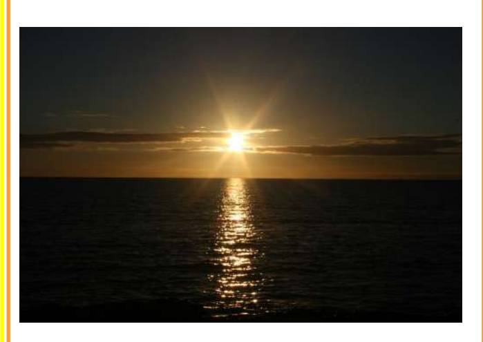
Light and love came down

https://comewalkwithme-reflections.blogspot.com