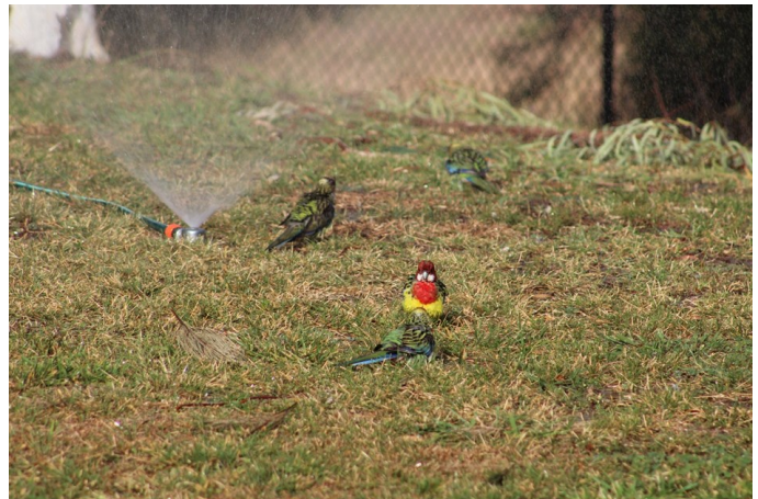
Dancing around and under the sprinkler!

https://comewalkwithme-reflections.blogspot.com