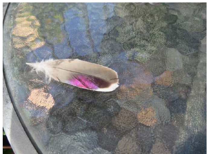
A gift of delight

https://comewalkwithme-reflections.blogspot.com