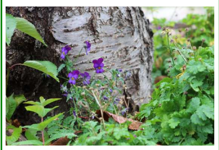
Not just a cluster of weeds