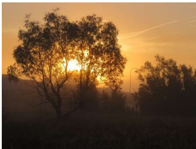
A moment of nourishment