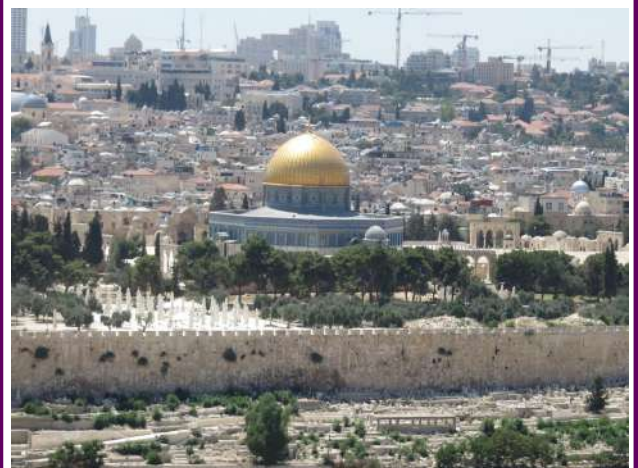
The Dome of the Rock, Mount Zion, Jerusalem

https://comewalkwithme-reflections.blogspot.com