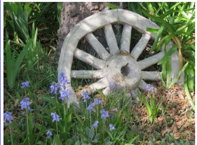
A garden full of bluebells

https://comewalkwithme-reflections.blogspot.com