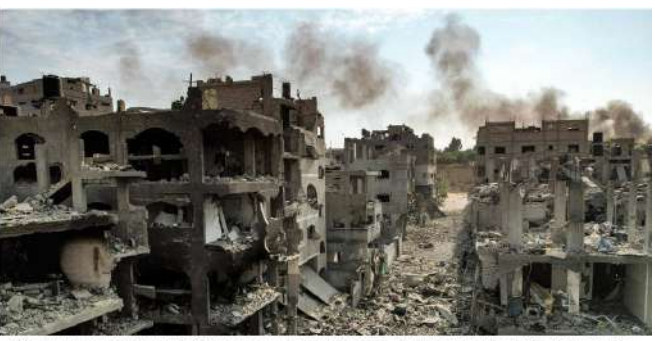
his picture taken on October 11.2023 shows an aerial view of buildings destroyed by Israell air strikes in the Jaballa amp for Palestinian refugees in Gaza City.

Over the past two months, hospitals, clinics, and churches have been bombed. At least 60% of housing in the Gaza Strip has now been destroyed or is uninhabitable.