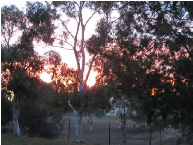
Pink hues in the snow gum