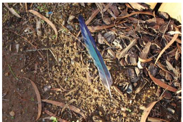
A gift from the 'flying sideways' birds