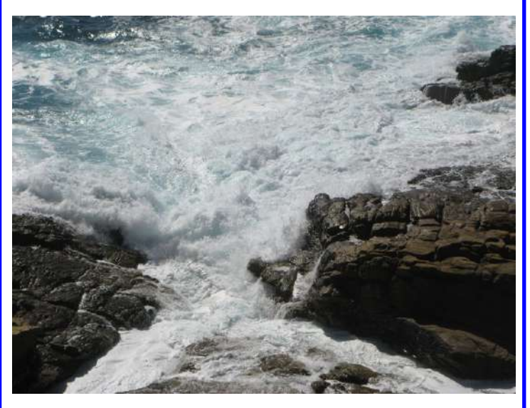
A stormy sea