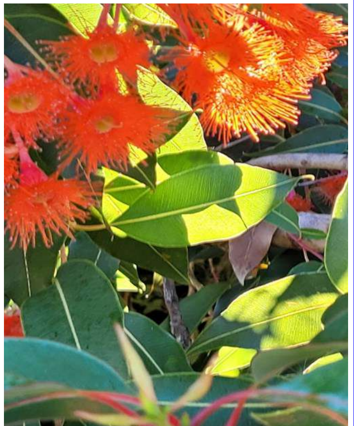
Red flowering gum

https://comewalkwithme-reflections.blogspot.com/